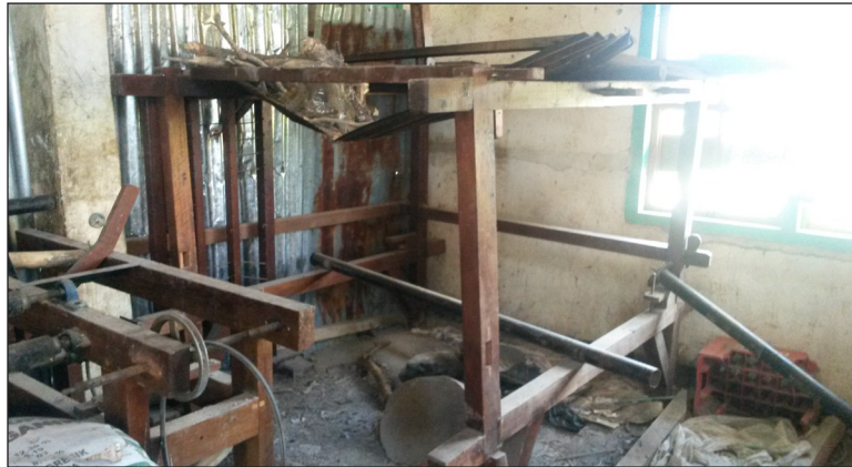
Figure 4. A broken non-mechanical loom (ATBM), Bea Mese cluster

ideas and obscure actual outcomes. Indeed, such was the case with the clustering policy that followed a global logic of economic growth, but did not consider the actual aspirations of women weavers or social conditions.