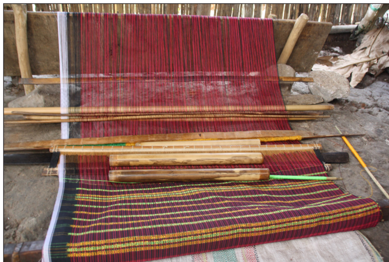
Figure 1. Traditional handloom with tenun Todo

Tenun ikat is not only presented as a gift to kin at milestones of life, but also a commodity sold at market, to a consumer base that is approximately 75% local to Manggarai. The other 25% of buyers are domestic and international tourists, as well as buyers for shops in Labuan Bajo, Denpasar, and Jakarta (Livens, personal communication, May 23, 2015). In recent years, tenun ikat has faced competition from both weaving produced on mechanical looms and cheaper fashions made in factories.