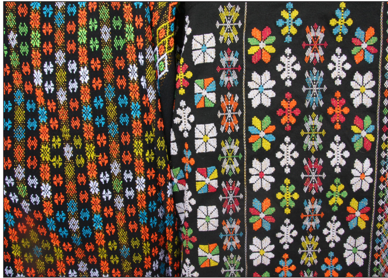
Figure 2. Two different types of motifs of tenun songket

Unlike those products, however, tenun ikat displays a connection to place in distinct designs for each village and region. As such, it represents how, despite academia's sustained focus on the homogenising nature of globalisation, 'places continue to be irreducible to each other or to any single global logic ... The fact of having a body and living in place – embodiment and emplacement are fundamental human features' (Harcourt & Escobar, 2009). In that case, however, how does having a female body in a place at the geographical margins of the market determine experiences of development?